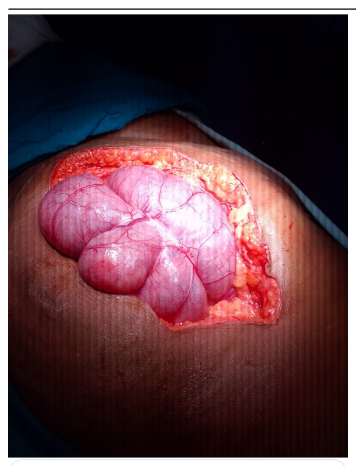
Figure 2: Ovarian germ cell tumour bulging out in shape of human brain.