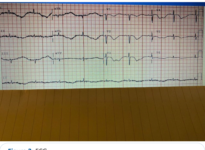
Figure 3: ECG