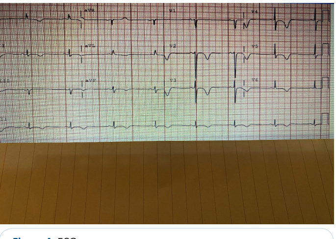
Figure 4: ECG