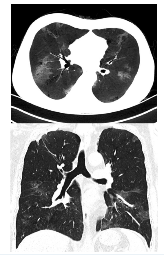
Figure 2a-b: CT chest with bilateral central and peripheral ground-glass parenchymal opacities, suggestive of possible interstitial lung disease, atypical pneumonia, or alveolar hemorrhage.

A vitamin C assay confirmed severe deficiency (<2.3 \mu mol/L; reference range: 23.0-85.0 \mu mol/L), leading to the diagnosis of scurvy. Treatment with supplemental ascorbic acid resulted in clinical improvement: Dyspnea disappeared