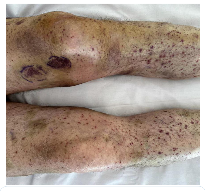
Figure 1: Lower limbs petechiae and hemorrhagic suffusions.

A detailed medical history uncovered the patient's poor diet, excessive alcohol consumption, and avoidance of fruits and vegetables for months.