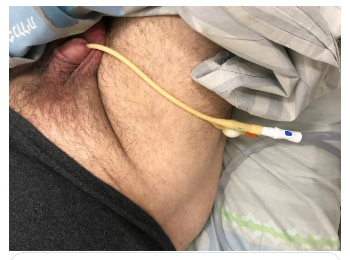
Figure 2: Lack of urethral-catheter fixation with improper balloon inflation.

The prevalence of tube-related complications in urology departments is largely unknown and likely under-reported. The literature on non-infectious drainage tube complications is scarce, with best practice recommendations for prevention and management based only on small case series [17,18]. For example, Turo et al. reported on nephrostomy tube-related complications. They analyzed a cohort of 66 hospitalized patients and found tube dislodgment, site infection, and tube blockage in 6% of patients [17]. This is similar to the 4.5% nephrostomy tuberelated complications in our study that included kinking of the tube on itself, twisting around the patient's body, and tangling of the collection bag. Importantly, 5% of the patients in Turo's report developed serious complications, such as sepsis and hemorrhage, which were not noticed in our cohort.