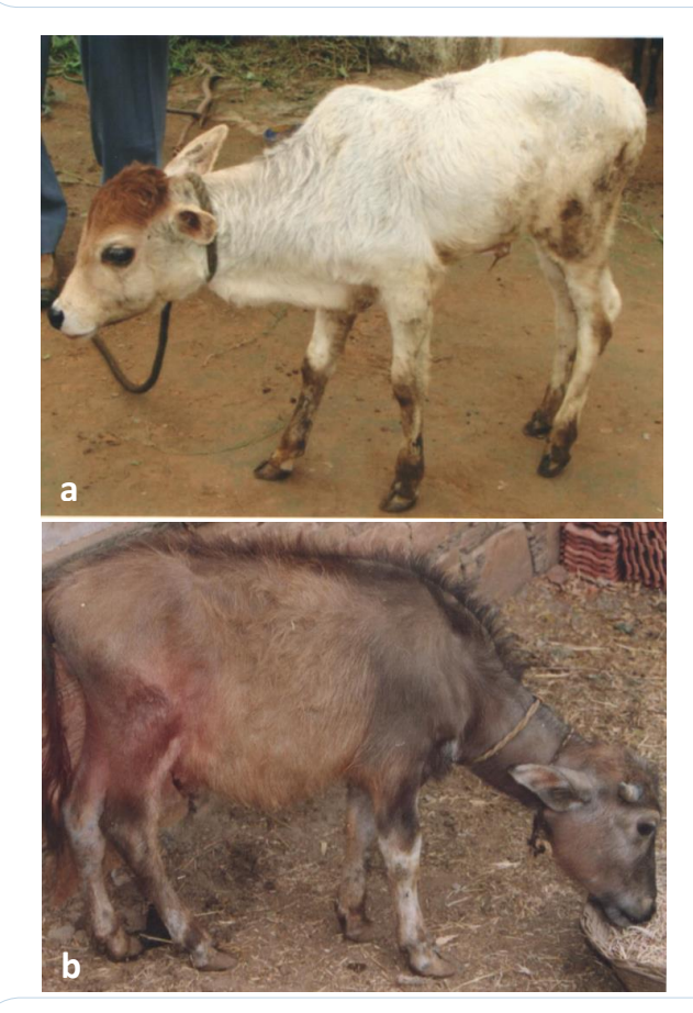
Figure 2: Moderate skeletal fluorosis in emaciated one-monthold cattle (a) and < 6 months buffalo (b) old calves. Note wasting of body muscles, bulging of bony lesions on legs and intermittent lameness in hind legs.