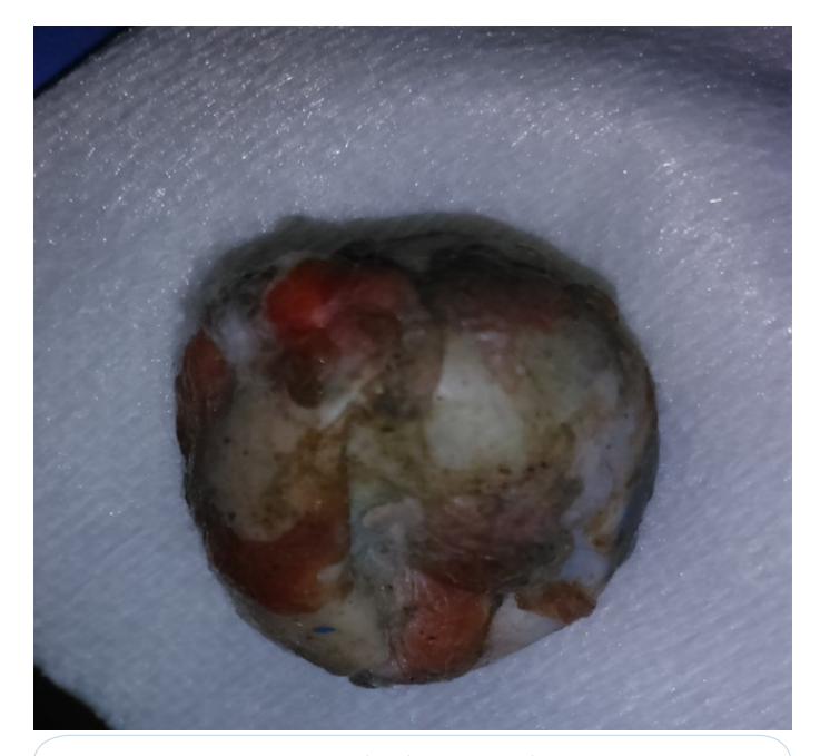
Figure 5: Optic nerve completely sectioned.