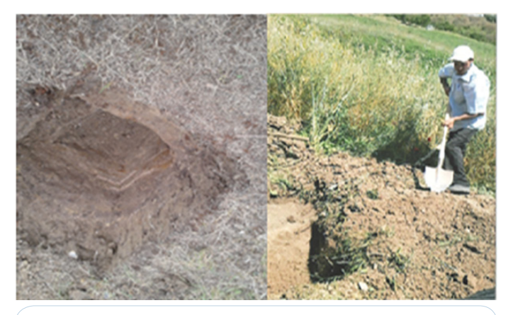
Figure 1: Field soil erosion studies.

Of course, we do not consider such a calculation of the amount of washed soil to be methodologically correct. This is explained by the fact that turning one hectare of washed land into one hectare means that the entire area of one hectare is completely covered with furrows, which is impossible.