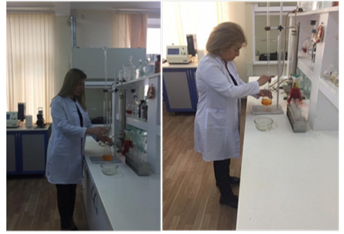
Figure 2: Laboratory analysis of soil samples.

From this point of view, in order to increase the efficiency of the research, the relevant research methodology was selected in accordance with the work plan, 1 ha of experimental area was selected in the Institute's Support Station, located in Melham village of the region for field soil erosion research, agrotechnical measures, including preparation of relevant fields have been carried out.For this purpose, the relevant research methodology was selected in accordance with the work plan, the relevant agro-technical measures, including the relevant agro-technical measures in the area of 1 ha, located in the territory of Melhem village of the region, in the Support Station of the institute. Relevant field leveling works were carried out.