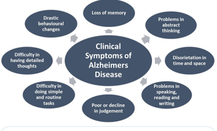
Figure 1: Clinical Symptoms of Alzheimer Disease.

✓ Stage Three: It lasts one to three years and is characterised by incontinence, swallowing difficulties, the development of skin infections, and seizures.