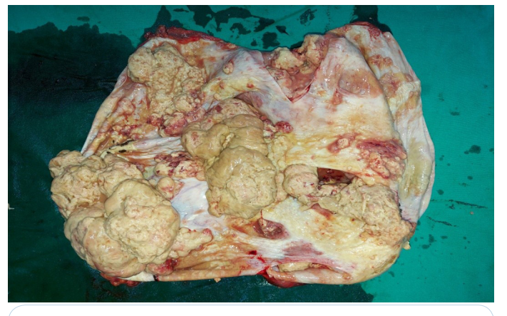
Figure 2: Cut open specimen (after drainage of fluid).

The specimen weighed approximately 7kgs and 4litres of light brownish cystic fluid was drained after giving multiple nicks. On cutting open the specimen, multiloculated cystic renal mass with peripheral solid components was noted with no gross renal tissue being identified. The cut open specimen is shown in Figure 2.