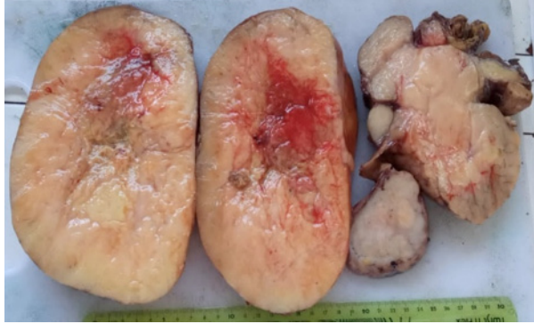
Figure 2: Macroscopic appearance of a voluminous dedifferentiated liposarcoma, respectively retro-peritoneal of 30 cm well encapsulated, firm with whitish areas, necrotic, slightly hemorrhagic and 20 cm hard testicle with unidentifiable spermatic cord lumen.