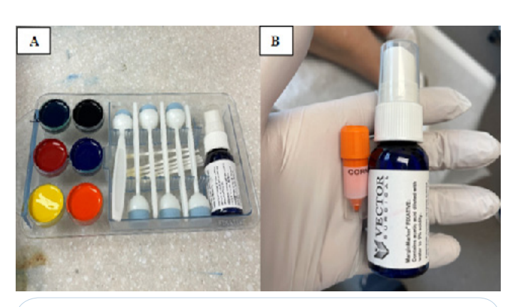
Figure 2: (A) Vector Surgical Margin Marker ink kit showing sterile dye with dip applicators. (B) Vector Surgical Margin Marker Fixative spray containing acetic acid used to adhere the dye to the specimen.

Figure 1: (A) Traditional reflectance confocal microscopy (Vivascope 1500; Caliber Imaging and Diagnostics, Inc.) showing heterogenous nests of melanocytes (red asterisks) in the dermal epidermal junction corresponding to the atypical globules seen around 3 o'clock on the dermoscopic image (black arrow). (B) Careful application of sterile surgical ink (Vector Surgical) to the corresponding area of the mole that is concerning on confocal microscopy. (C) H&E staining (20x) demonstrating small melanocytic nests (yellow asterisks) that are distinctly stained by the surgical dye and single melanocytes along the basal layer.